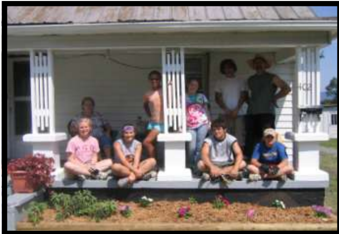
Taking Care of the "Little White House"

Initially I was surprised when the editor asked that I write about the transformation, over time, of youth programs and ministries at CLCC; then it dawned that I was a logical choice. After all, I remember being frequently the ONLY one in youth Sunday School (little brothers don't count!), having no church home on Sunday or Wednesday nights, and hearing all of my school friends rave about their youth programs and then invite me to join them at their church. I do remember all of that; and I remember exactly when and how it began to change.